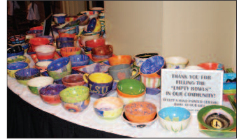
2017 Food Bank of Northwest Louisiana Empty Bowls Hunger Awareness Event